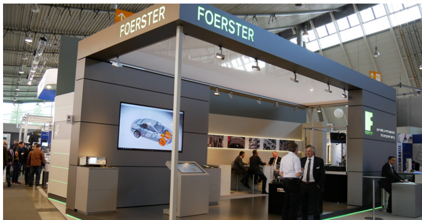
Figure 1: The FOERSTER booth at the Control 2018