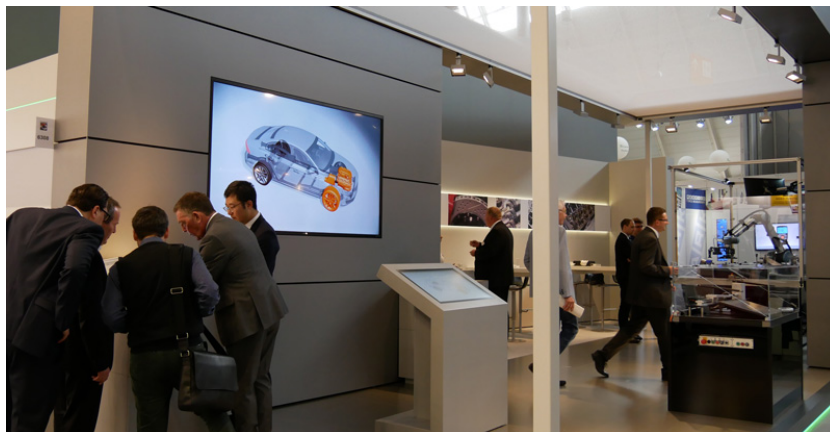
Figure 2: Many interesting discussions took place