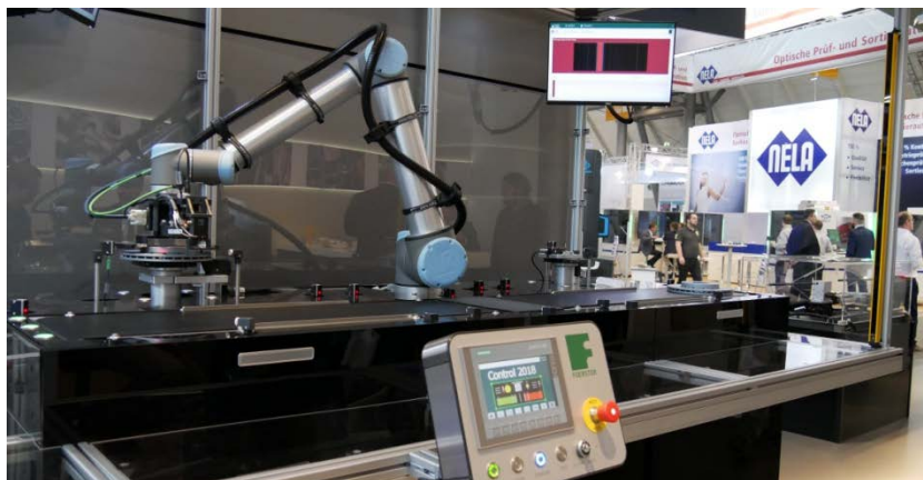
Figure 4: The fully-automatic test system for brake discs including the STATOVISION Software